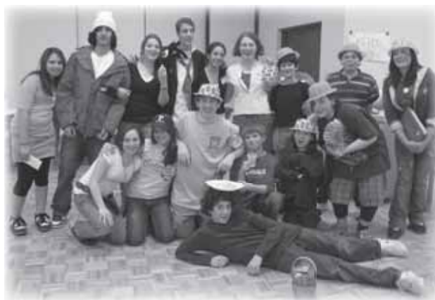
Photos from Purim Carnival